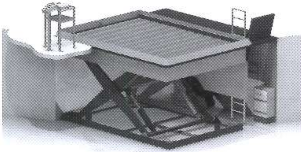
Example of a Lowering Build-Up / Break Down Work Station

The workstation consists of a hydraulic operated scissor lift with a roller deck to be installed in a concrete pit. The workstation operates at variable heights between 508 mm above floor level and 1,500 mm below floor level.